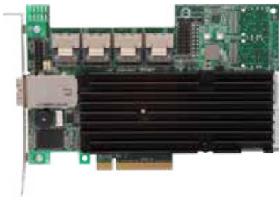
3ware SAS 9750-16i4e

Unprecedented power in multi-stream RAID environments delivers high-performance and reliable data protection.